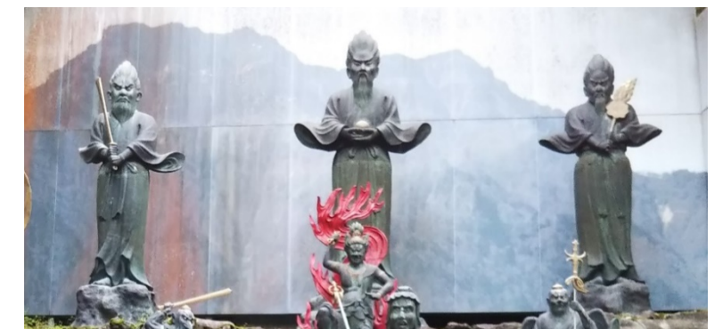
the three deities of bravery, virtue and wisdom